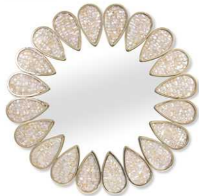
Hang mirror 160cm off the floor to the centre of the mirror