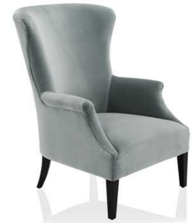
Place arm chair in the corner facing room