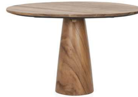
Place table on top of rug