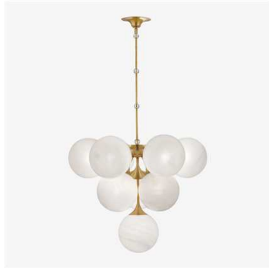
Hang pendant 86cm above the table