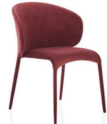
Purchase 4 dining chairs