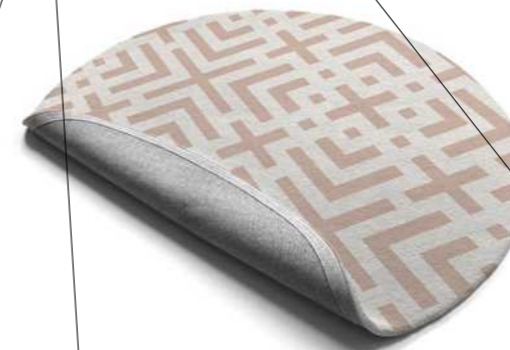
Place rug in the centre of the room