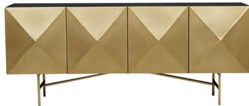
Place buffet on the opposite wall to the fireplace