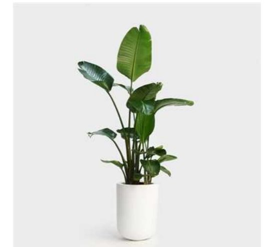
A potted plant in the corner will fill in the space nicely