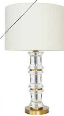
Place lamp on buffet