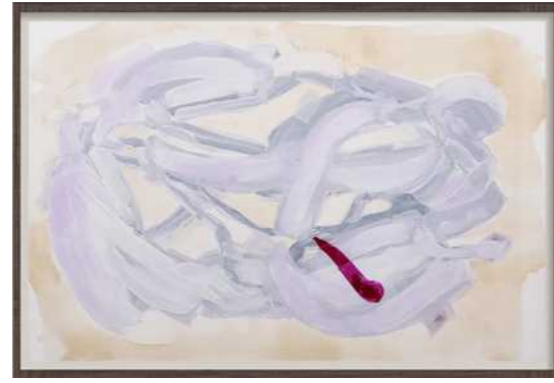
Hang artwork 20cm above the mantel